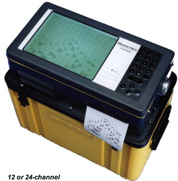
12 or 24-channel exploration seismograph

Look no further – the SmartSeis seismograph is an integrated seismic exploration system that can provide answers right in the field with built-in rugged PC, daylight-visible screen and even a high-resolution plotter so you can show results to your clients.