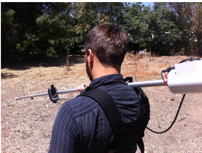
G-857 and Optional Garmin GPS

The automated cycling option with long sensor cable and external power connection allows the G-857 to be used as a base station instrument for the measurement of diurnal changes in the Earth's magnetic field. Diurnal correction data is then downloaded using MagMap2000 and can be applied to other land or airborne magnetometer data.