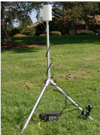
G-857 Base Station and Optional Garmin GPS

The G-857, based on the popular G-856AX (over 2,800 units sold), provides excellent performance and is the lowest priced professional magnetometer system available. Combined with the ease of use, user friendly download/editing software, and readily available commercial contouring programs, the G-857 represents a complete magnetic surveying package generating high quality data for budget conscious users.