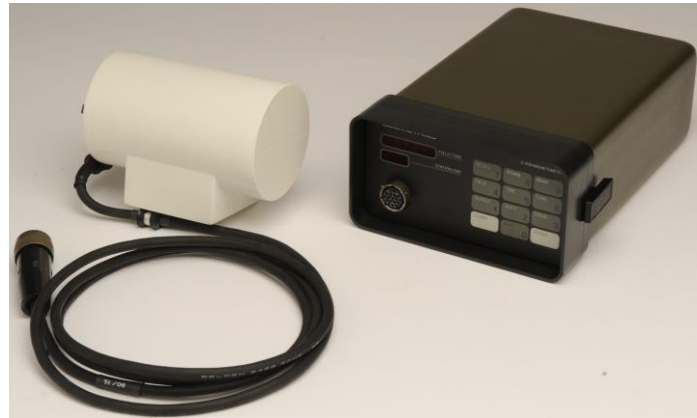
G-857 Console and Sensor

The G-857 provides a reliable, low cost solution for a variety of magnetic search and mapping applications. Single key stroke operation means the G-857 can be operated by non-technical field personnel or used in teaching environments. The G-857 uses the well-established proton precession method, allowing accurate measurements to be made with virtually no dependence upon variables such as sensor orientation, temperature, or location. The unit provides a repeatable