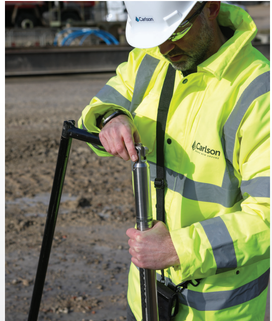
The quick-to-deploy Boretrak is designed for use by a single operator.

The Rodded Boretrak system is ideal if needed to be deployed to great depths. Cabled probes limit users to the fixed cable length originally purchased. With Rodded Boretrak, additional stacks of rods can simply be added to be deployed down deeper holes.