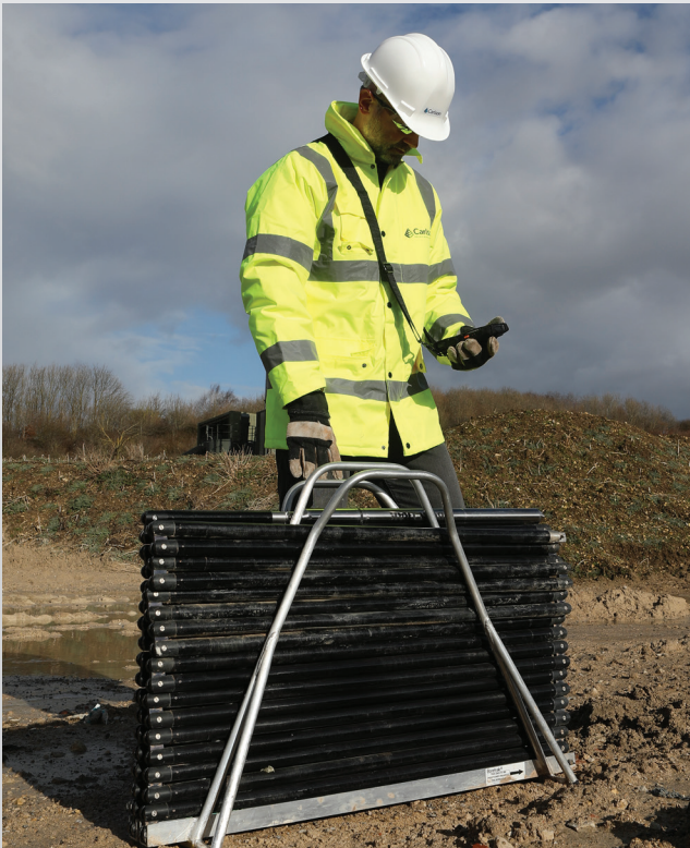
Rodded Boretrak's rods guide and locate the probe.