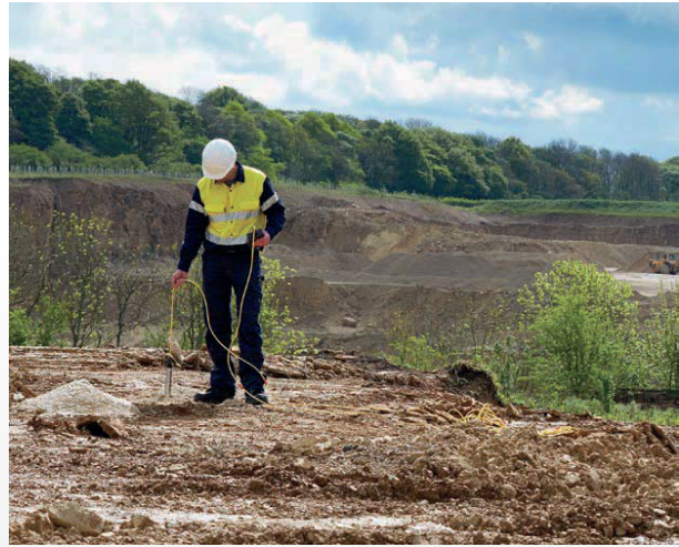
The benefit of a Cabled Boretrak is speed and portability.