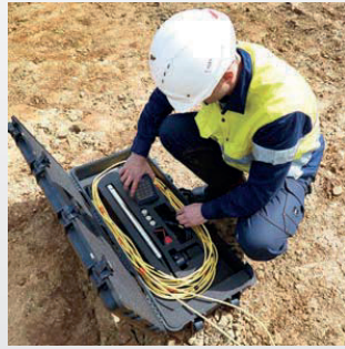
Carlson's Cabled Boretrak system is supplied in a Peli-case that can be hand carried by a single operative.