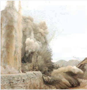
The Boretrak system enables faster yet safer rock face blasting.

Drilled holes are employed in a wide variety of quarrying and mining projects and need to be drilled to a specified depth, inclination, and heading. Deviation from these specifications can pose real dangers and also increase costs due to unpredictable blast results. The Carlson LMD Boretrak provides a reliable way of measuring borehole deviation by taking the actual results of drilling activity into account. When used as part of the blast design package, this ultimately saves mine and quarry owners on secondary breakage, transport, explosives, and fuel costs as well as increasing worker safety and that of others working or living near blast sites.